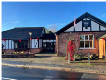
Acton Bridge WI prepare Poppy Tributes