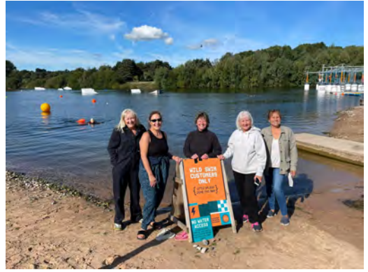
WT's scientific approach to Gin tasting. Open Water Swimming Amazons Ahoy!