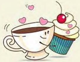
COFFEE & CAKE

As well as our monthly meetings a number of activities were recently enjoyed, after the disappointments and worries of lockdown .